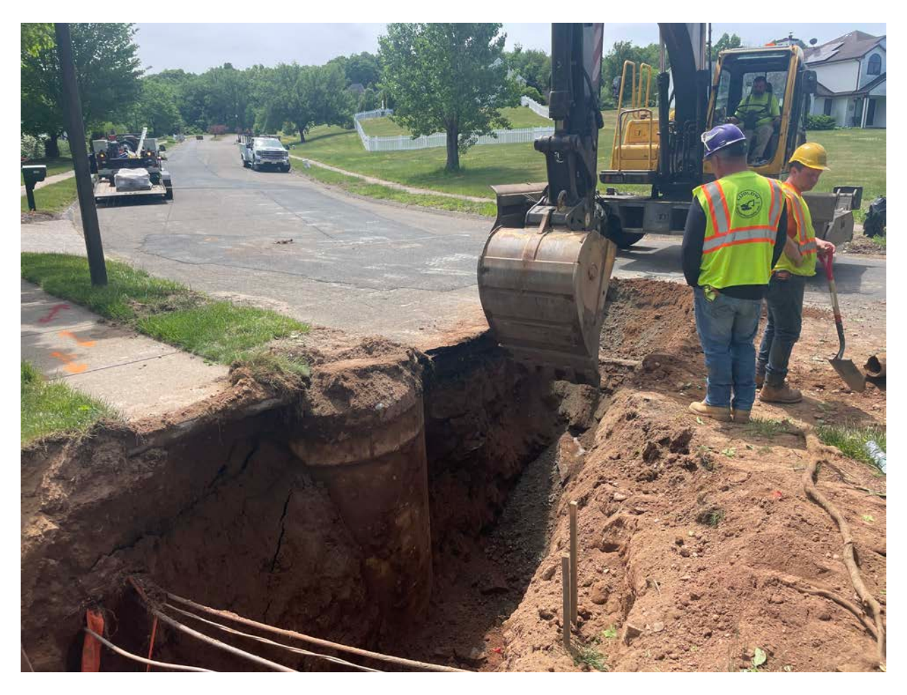
Picture 7: Ludlow excavating at Station 40+41 as they work to connect the 12" DIP water line coming from Round Hill Road to the 16" DIP water line located on Talcott Ridge Drive. View to the northeast.