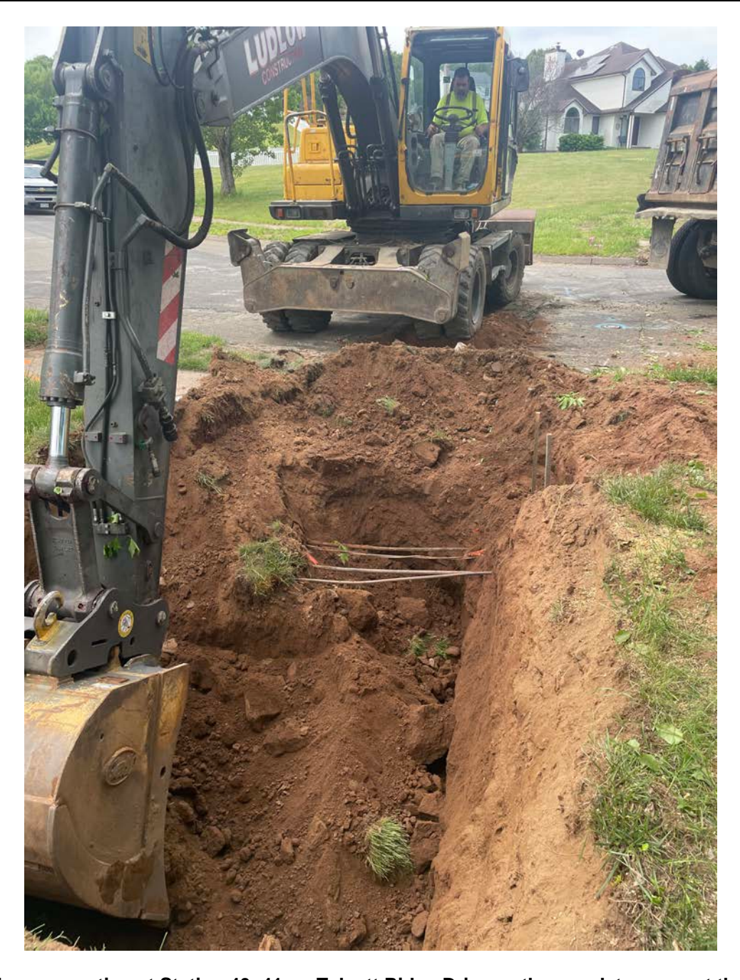
Picture 4: Ludlow excavating at Station 40+41 on Talcott Ridge Drive as they work to connect the 12" DIP water line coming from Round Hill Road to the 16" DIP water line located on Talcott Ridge Drive. View to the east.