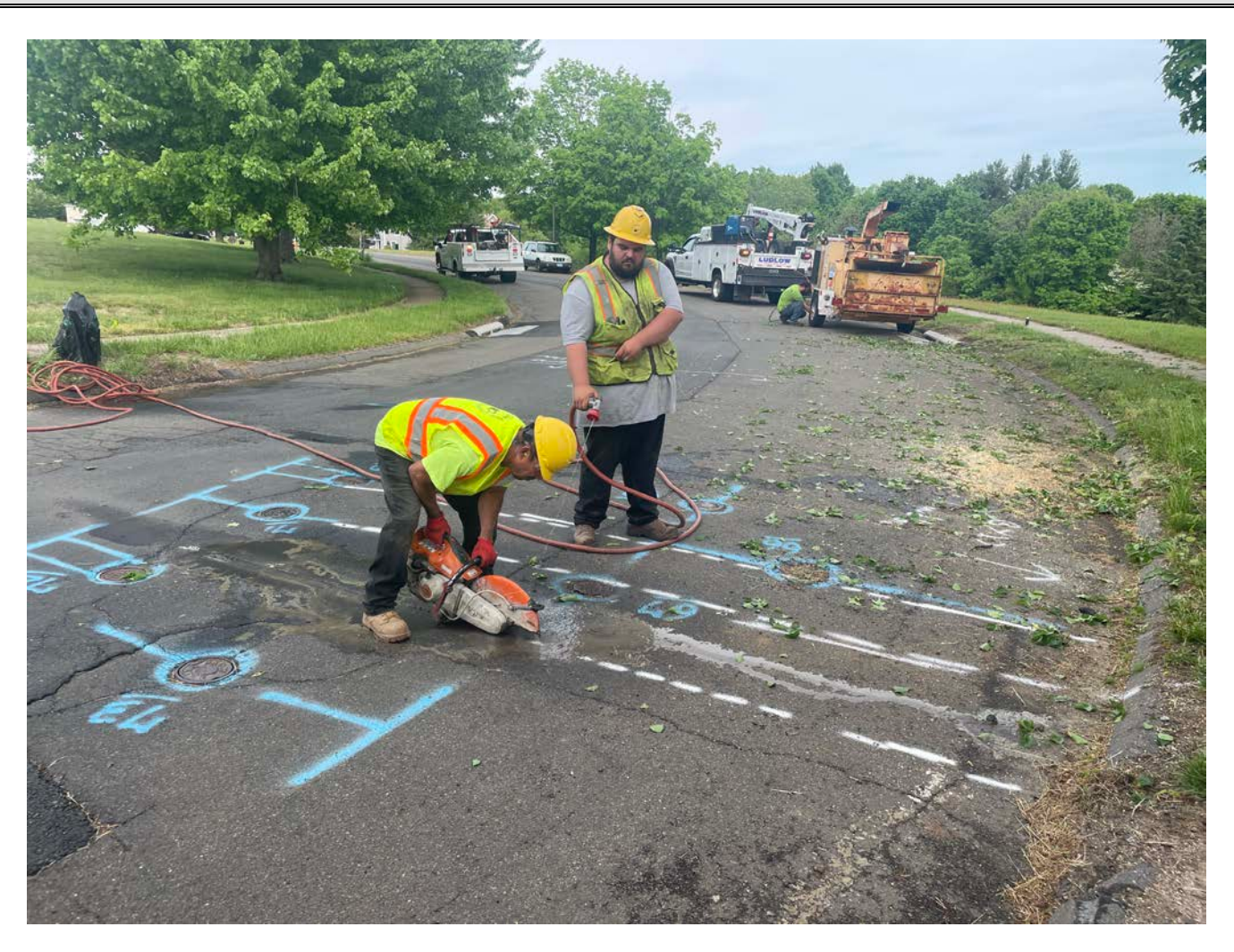
Picture 2: Ludlow saw cutting on Talcott Ridge Drive at Station 40+41 as they prepare to connect the 12" DIP water line coming from Round Hill Road to the 16" DIP water line located on Talcott Ridge Drive. View to the west.

Contractor: Ludlow Construction Page: 5 of 12