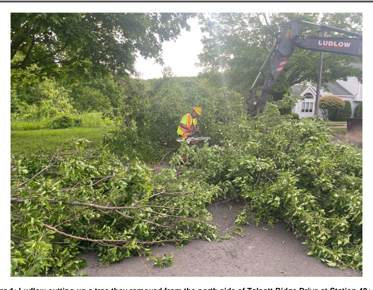
Picture 1: Ludlow cutting up a tree they removed from the north side of Talcott Ridge Drive at Station 40+41 as they prepare to connect the 12" DIP water line coming from Round Hill Road to the 16" DIP water line located on Talcott Ridge Drive. View to the northwest.

Contractor: Ludlow Construction Page: 4 of 12