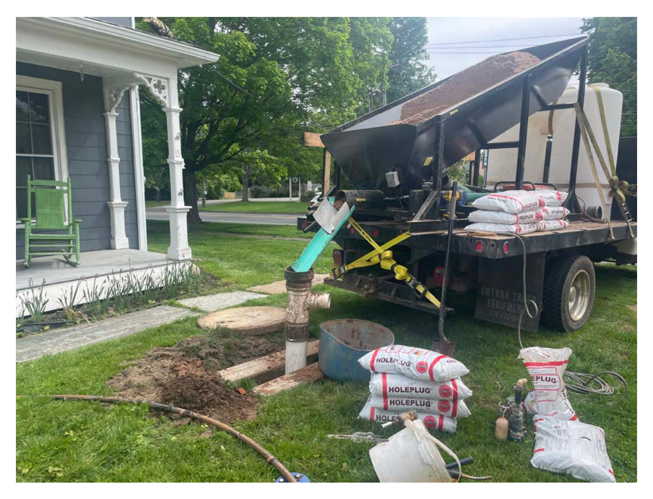
Picture 3: Grela set up to place sand into the well located on the south side of the 242 Main Street, Durham residence as part of well decommissioning activities. View to the northeast.