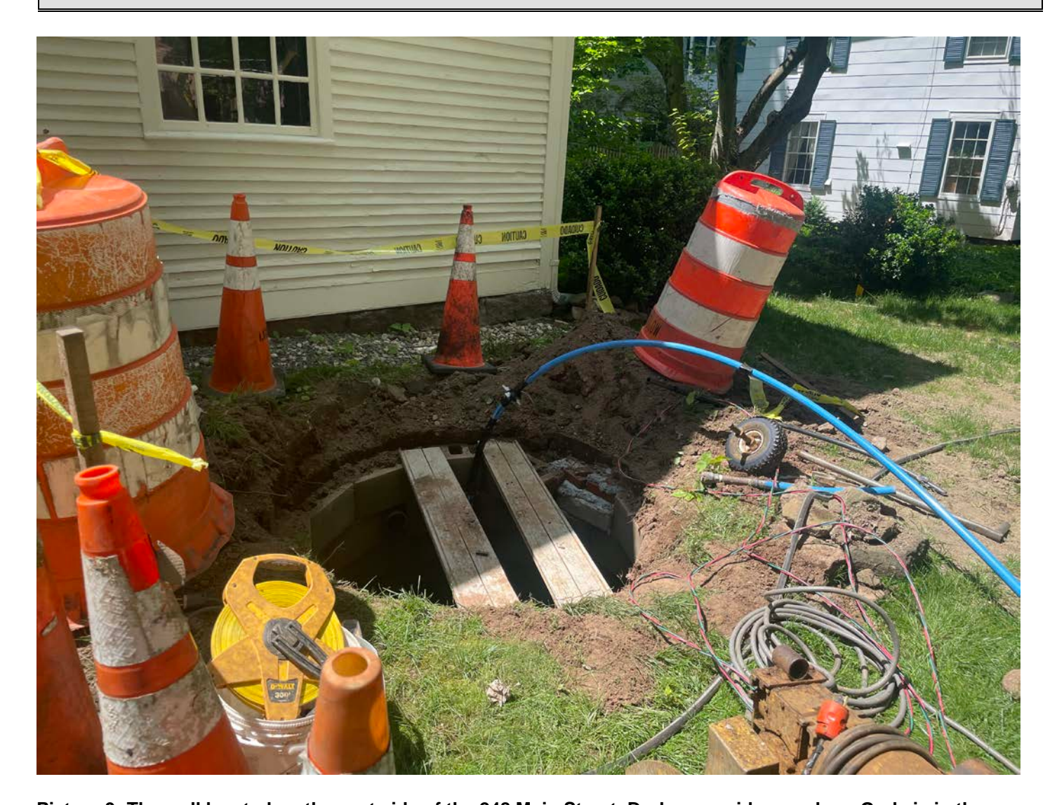
Picture 9: The well located on the east side of the 248 Main Street, Durham, residence where Grela is in the process of removing the pump from the well prior to filling the casing with sand followed by bentonite chips. View to the northwest.